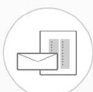
New Vote by Mail Experience