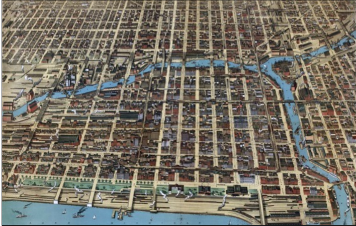
Expansion 2.0: Poole Brothers, “Bird’s-eye-view of the business district of Chicago” (Chicago, 1898), available in Library of Congress Geography and Map Division.