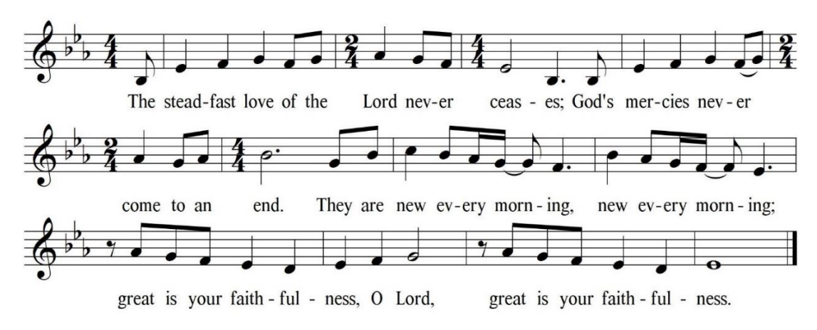
Choir and congregation sing refrain; choir sings verses