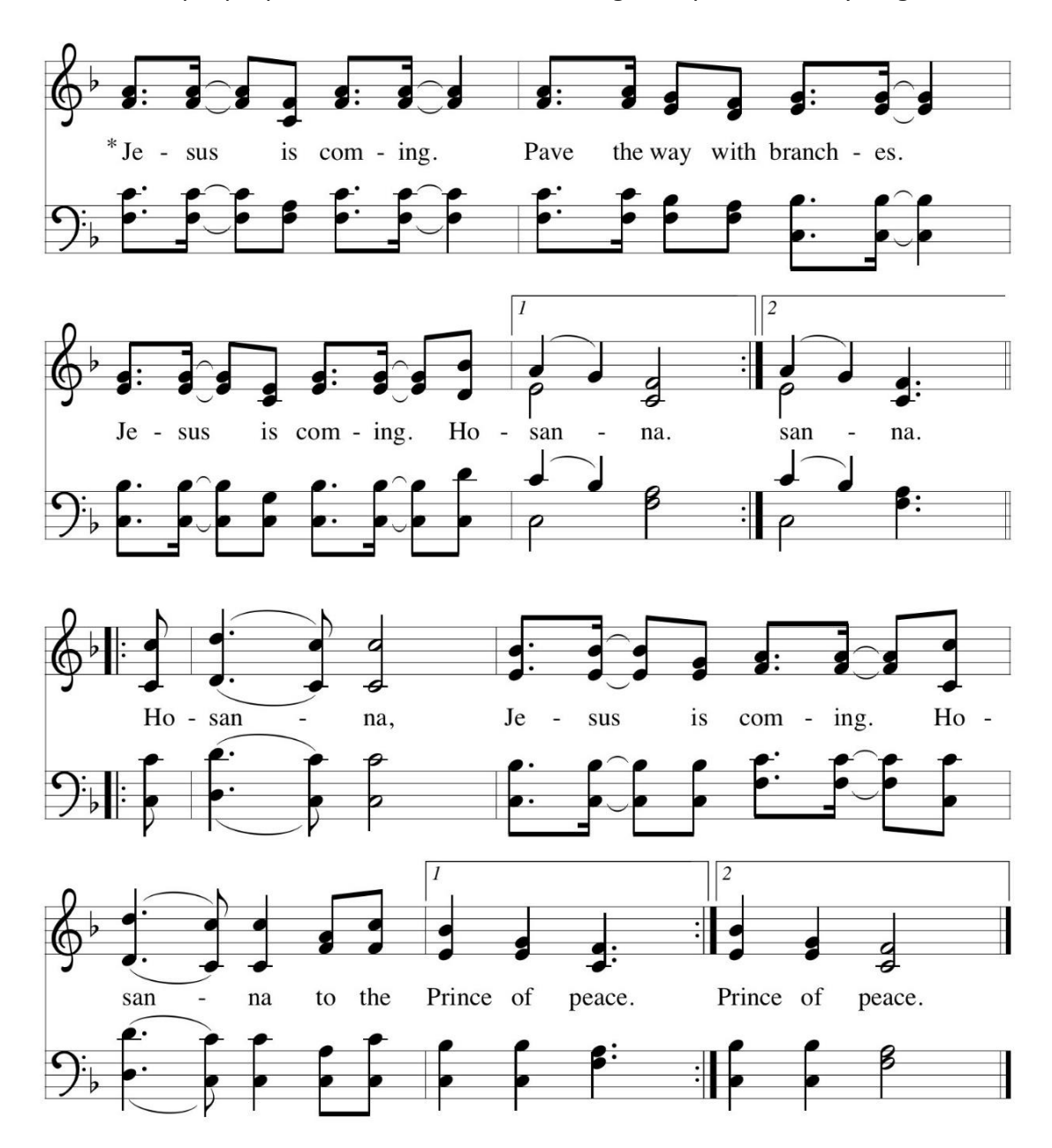
The people process into the church, waving their palms, as they sing.

"Pave the way with branches," tune Bret Hesla, copyright 1999 Augsburg Fortress Publishers.